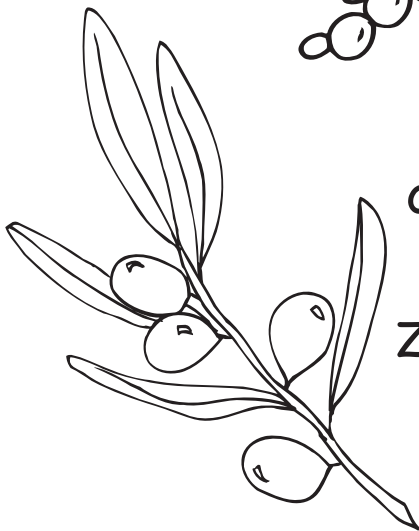
olive זַיִת Zay-it