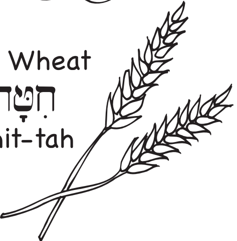
Wheat חִטָּה Chit-tah