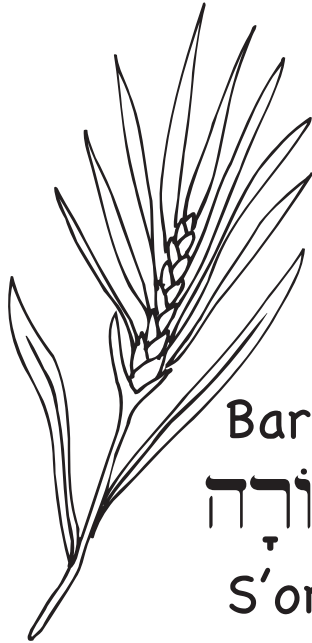
Barley שְׁעוֹרָה S'orah