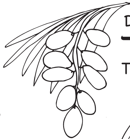
Date תָּמָר Tamar